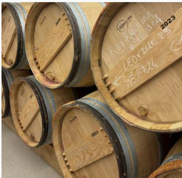
Château Léoville Barton represents Tonnellerie Maury's biggest customer purchasing on average 500 barrels per year.