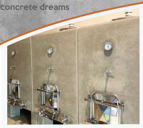
Tailor made 9, 11, 13 and 17 HL Standard tanks for Miani in Italy's Friulli region

CLC Vasche, which stands for "Cooperative Lavorazione Cementi," is a family-owned and run company located outside of Padova in North Eastern Italy. CLC is a leading manufacturer for standard and tailor made concrete tanks for wine production, whose tanks can be found throughout Italy, France, Spain, South Africa and other important winemaking countries throughout the world.