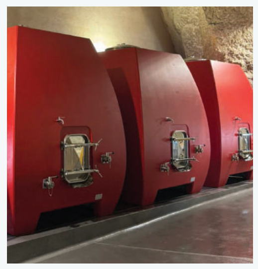
40\ HL Cru tanks at Domaine Annivy in Saumur in the Loire Valley

A state of the art, computerized machine is used to accurately and consistently mix the right amounts of all necessary aggregates, cement, and water in order to guarantee a consistent and optimal mix of concrete across all tanks. For small standard tanks, the concrete is poured inside of molds and allowed to cure. For larger tanks, rebar and reinforced steel is used to provide structural support to the tank.